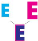
All other lenses

SHAW VISION® lenses project the same size image to each eye so your brain can use the eyes together more efficiently. In addition, binocularity is enhanced throughout the entire visual field. This provides unrivaled comfort and function, providing a solid foundation for clear, single, binocular vision no matter where you look.